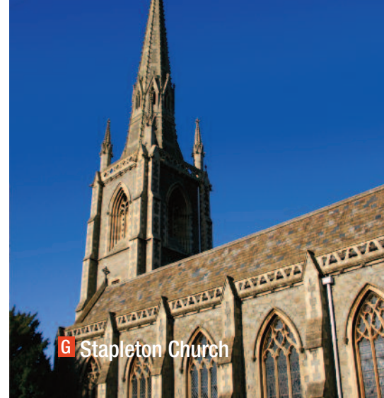
G Stapleton Church