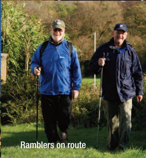
Ramblers on route