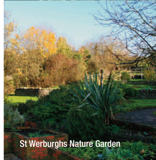
St Werburgh's Nature Garden