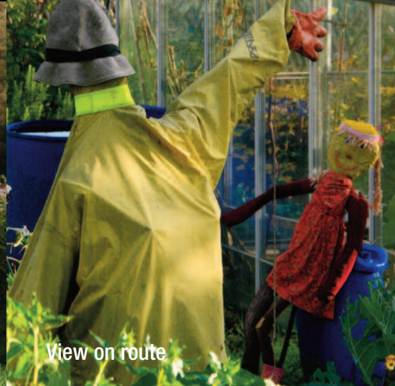
View on route