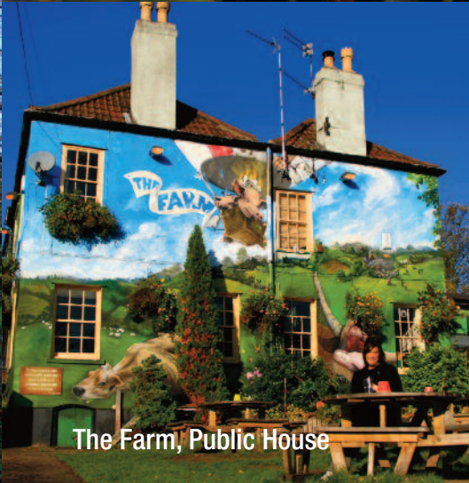
The Farm, Public House